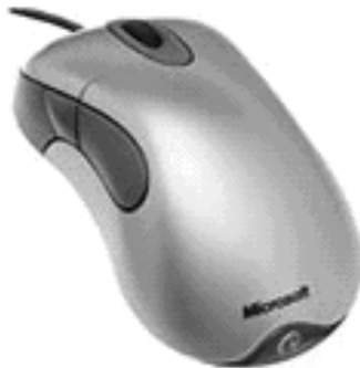
Figure 2. Microsoft Intellimouse.

The application DotClicker™ was developed for the purpose of providing a standardized precision task. Small dots appear, one at a time, randomly on different locations on the screen. Clicking on the spot immediately triggers the appearance of the next one.