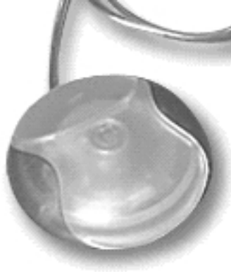
Figure 3. Apple mouse.

Hitting within 10 pixels of the center of the dot results in its disappearance and a new dot appearing elsewhere. Speed requirement was presented to the participants as fairly swift . The traditional reference mice were Microsoft® Intellimouse Optical and Apple® standard ball mouse.