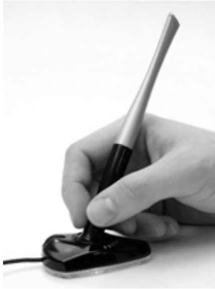
Figure 1. The new pen grip controlled concept mouse, UllmanMouse.